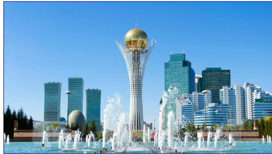
Joint 46/46th meeting of RCC Commission for the Coordination of International Cooperation & Working Group on cooperation with ITU