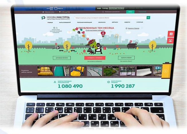
Our City's interface